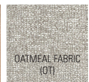
OATMEAL FABRIC (OT)